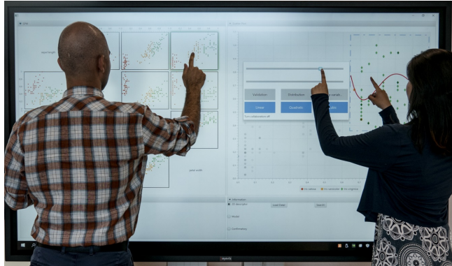
Figure 3: An example of solving visual analytics tasks on a large vertically-mounted multi-touch display.